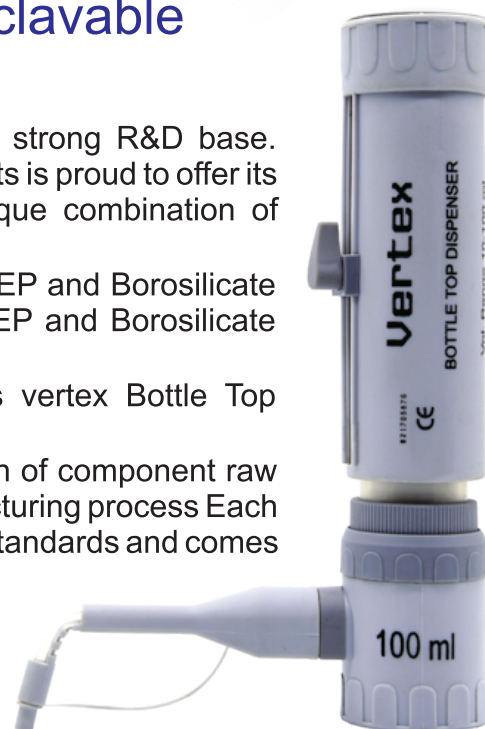
10-100 ml Premium Model