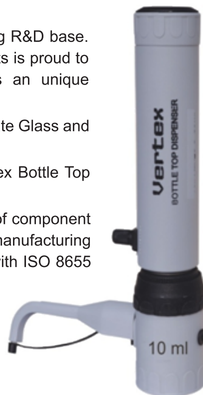
1-10 ml Regular Model